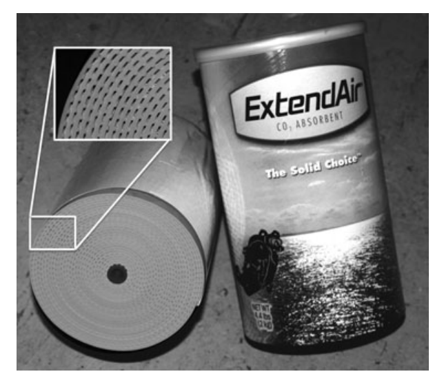
Figure 3 The Solid State ExtendAir<sup>TM</sup> calcium hydroxide CO_2 absorber. The inset shows the castellation channels incorporated to aid the flow of gas through the absorber.

A plastic housing made from Delrin (DuPont, Wilmington, DE, USA) was used to hold a nongranular ExtendAir<sup>TM</sup> CO<sub>2</sub> absorber (Micropore Inc., Newark, DE, USA) containing 2 kg of calcium hydroxide (CaOH) (Fig. 3). Two bespoke T-shaped connectors (CRDM Silicone sealed SLS Nylon-12) were used to connect the 35-mm inspiratory and